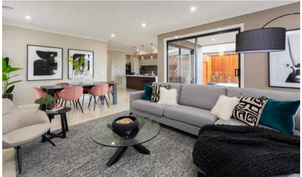
Photo is for illustrative purposes only and does not depict the home for sale. This image contains internal or external luxury upgrade items and furniture not included in the home price.